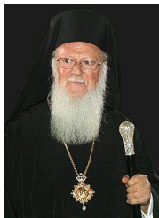
Patriarch Bartholomew His All Holiness BARTHOLOMEW Archbishop of Constantinople, New Rome and Ecumenical Patriarch