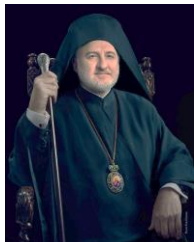
Eminence Archbishop Elpidophoros (Lambriniadis) of America

Exarch of the Atlantic and Pacific Oceans