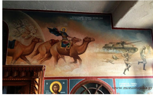
Fresco from the Holy Cell of St. Menas, Great Lavra Monastery, Mount Athos

In June 1942, during the North-Africa campaign that was decisive for the outcome of the Second World War, the German forces under the command of General Rommel were on their way to Alexandria, and happened to make a halt near a place which the Arabs call El Alamein (the place of Menas). An ancient ruined church nearby in Abu Mena was dedicated to Saint Menas; there some people say he is buried. Here the weaker Allied forces, including some Greeks, confronted the numerically and militarily superior German army, and the result of the coming battle of El Alamein seemed certain.