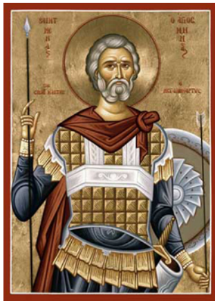
St. Menas, Feastday November 11th